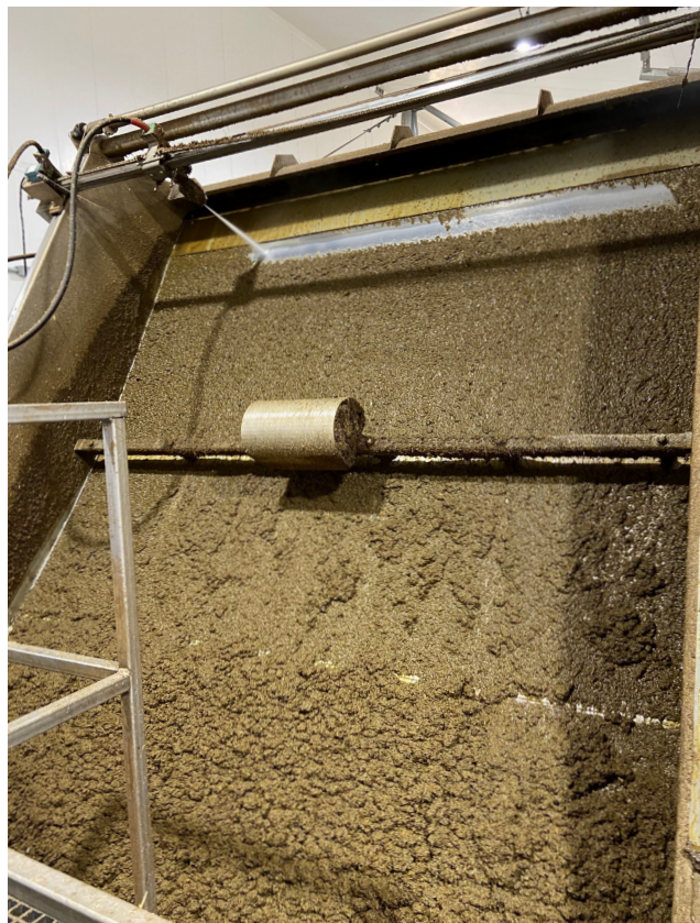
Figure 1. A sloped screen separator with a vibrator for additional dewatering and an automatic washer for cleaning dry and plugged particles.

One major disadvantage of sloped screen separation is cleaning labor. Solids stuck in the screen are generally removed manually, unless the separator has an auto-clean feature ( Figure 1 ). Another disadvantage of screen separation is its inability to remove very small solids. When the manure from a barn is flushed by lagoon water rich in fine solids, it will return these solids to the manure system.