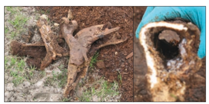
Figure 7. These bones of a 2,000-pound cow that remain from a cured compost pile are brittle, hollow, and fairly easy to crush.

After the pile is turned and moistened, the compost should heat up again and the decomposition process should continue. During this secondary phase the microbes finish off most of the available carbon and nitrogen and convert it into microbial biomass. At this point only the skull, pelvis and other large bones may still be present. Let the Phase II pile sit for about 2 more months until the temperature drops to within 10 degrees or so of the air temperature. Then turn the pile one more time and allow it to "cure" so that the remaining organic compounds (for example, acetic acid) will degrade all the way to carbon dioxide and