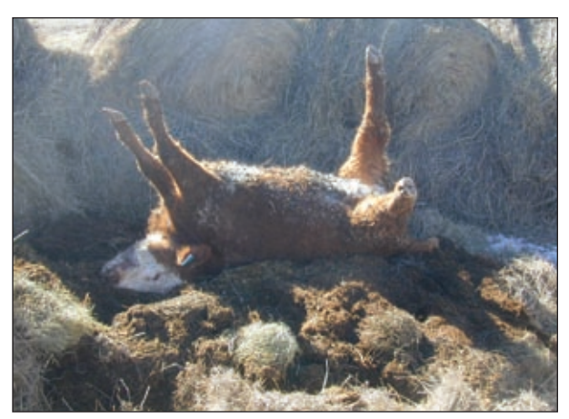
Figure 3. The limbs may need to be removed with a hacksaw, bolt cutters or shears to reduce the pile's total volume. Lay the severed limbs beside the carcass.

CAUTION: If you suspect the animal died from a zoonotic disease (one that can be transmitted to humans), do not open the carcass. Instead, notify your veterinarian and local authorities immediately.