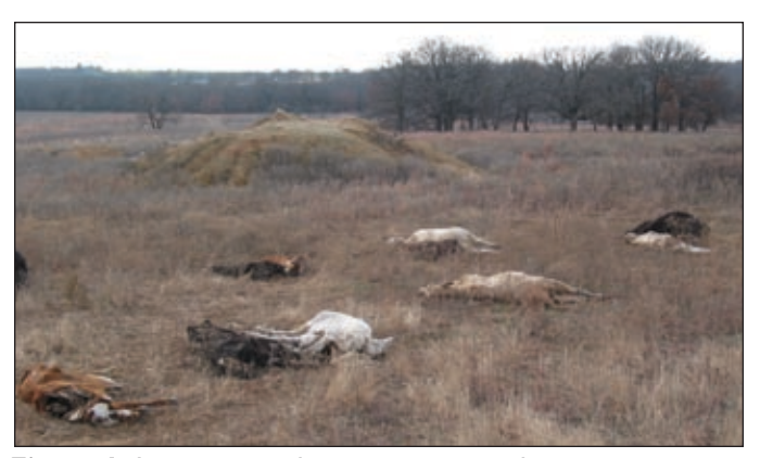
Figure 1. Leaving animal carcasses exposed to nature is not a good idea.

Every living being does best when it eats a properly balanced diet, and compost microbes are no exception. They need both carbon (C) and nitrogen (N) in the right ratio. Optimally, the nutrients in a compost pile should be about 30 parts C and 1 part N (30:1).