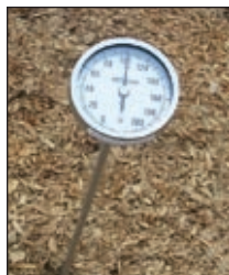
Figure 5. A long-stemmed, dial-type thermometer is used to monitor pile temperatures.

The easiest way to measure temperature at the pile's core is with a long-stemmed thermometer. It must be long enough to reach to the center of the pile. A 48-inch probe costs about $150.00. One model is the Reotemp 48-inch Heavy-Duty Windrow Thermometer ( www.reotemp.com ). Other manufacturers marketing good quality probes include Geneq ( www.geneq.com ), Omega ( www.omega.com ), Tel-Tru ( www.teltru.com ) and PTC Instruments ( www.ptc1.com ). Be sure to read the instructions carefully to learn how to insert the probe without bending or breaking the stem. Measure the temperature at various locations to determine its uniformity.