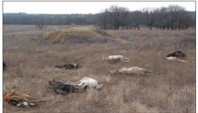
Figure 1. Leaving animal carcasses exposed to nature is not a good idea.

Every living being does best when it eats a properly balanced diet, and compost microbes are no exception. They need both carbon (C) and nitrogen (N) in the right ratio. Optimally, the nutrients in a compost pile should be about 30 parts C and 1 part N (30:1).