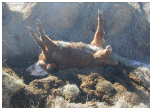
Figure 3. The limbs may need to be removed with a hacksaw, bolt cutters or shears to reduce the pile’s total volume. Lay the severed limbs beside the carcass.

CAUTION: If you suspect the animal died from a zoonotic disease (one that can be transmitted to humans), do not open the carcass. Instead, notify your veterinarian and local authorities immediately.