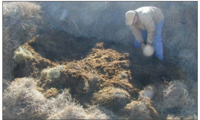
Figure 4. The co-composting material being used here is a moist mixture of horse manure and wood shavings bedding from a veterinary clinic.

To reduce odor and predator access even further, some composting specialists recommend covering the finished pile with the same dry materials used as the absorbent first layer. Doing so will improve pile insulation and heat retention, reduce oxygen transfer, and increase the volume of compost feedstocks. But it may not eliminate all odor and predators, and it is more