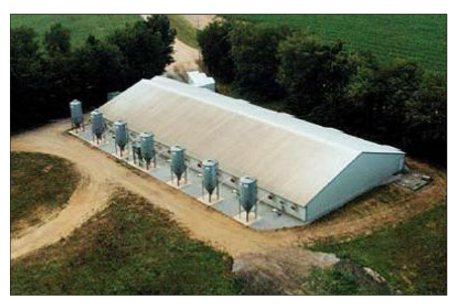
Figure 4. A windbreak around a swine barn.

Studies show that dust and odorous gases in the exhaust air from liquid manure pit fans or from ventilated livestock and swine buildings can be reduced by 50 to 90 percent with biofilters that filter and treat the air.<sup>5,7</sup> Biofilters are usually